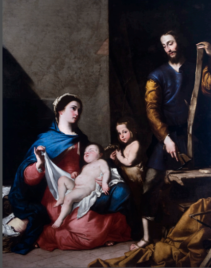
José de Ribera. The Holy Family . 1639