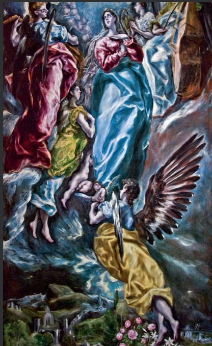
El Greco. The Immaculate Conception . 1608 - 1613

The composition offers a great variety of religious themes ranging from the establishment of the painter in Toledo in 1577 up until his death in 1614, and all its artistic and technical evolution during its Spanish period. The remarkable "Oballe" Immaculate, one of El Greco's most important works, is to be noted