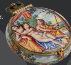
Pocket watch London, Windmills brand. 1671 - 1737