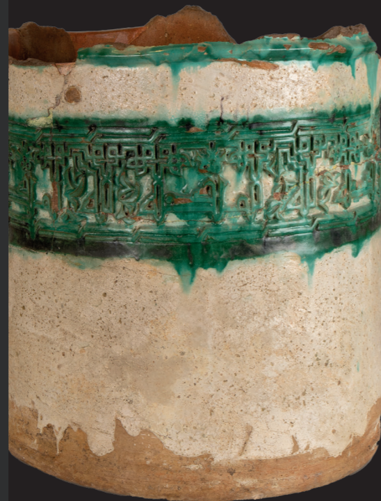
Cistern curb. 14th century. Taller del Moro (Toledo)