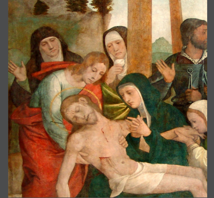
Juan de Borgoña. The Pietà . ca. 1500 - 1505

In 1844, Toledo's Provincial Museum is created and, after many decades without a fixed headquarters, in 1919 the museum's collections are established on the former Santa Cruz hospital, a 16th building that was built under the sponsorship of the cardinal Pedro González de Mendoza. The hospital had maintained its original purpose up until the middle of the 19th century, when it would become part of the army until its conversion into a museum in the thirties of 20th century.