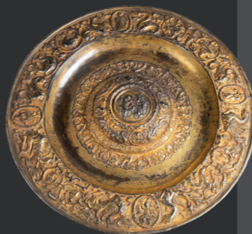
Gilded silver tray 16th century