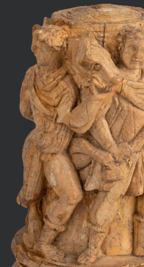
Relief of Hippolytus. 4th century AD Circo Romano (Toledo)