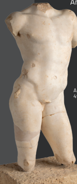
Apollo sculpture. 4th century AD

The museum of Santa Cruz is the provincial museum of Toledo and, therefore, the recipient of all the archaeological assets of the province. In the last room, it is offered an exhibition that covers all the historical periods represented in the provincial territory, from the Palaeolithic, passing through all the stages of Prehistory, the Ancient Age, the Middle Ages and the beginning of the Modern ones, with special attention to the artistic manifestations that connect with its Andalusian past.