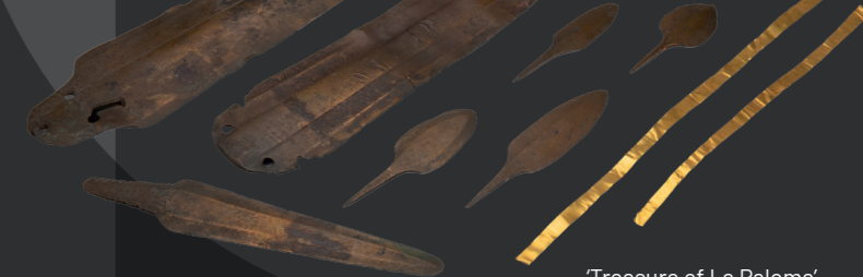
'Treasure of La Paloma'. Chalcolithic (2300 - 1800 BC). Finca "La Paloma" (Pantoja)