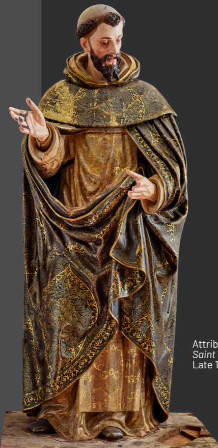
Attributed to Giraldo de Merlo. Saint Domingo of Guzmán . Late 16th century - Early 17th one